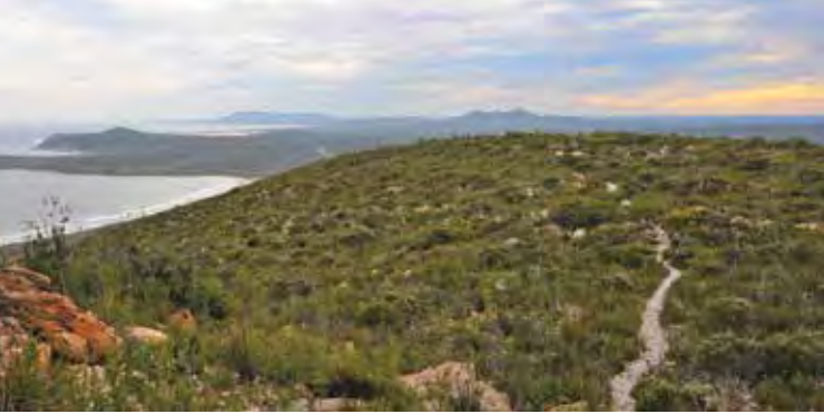
East Mount Barren plateau.