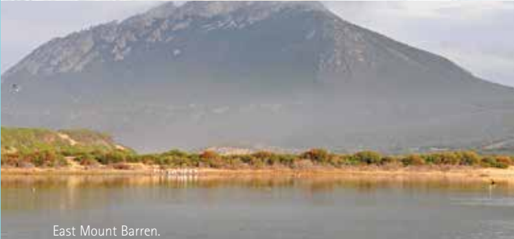
East Mount Barren.

Migratory humpback and southern right whales are often seen moving along the coast between May and October.