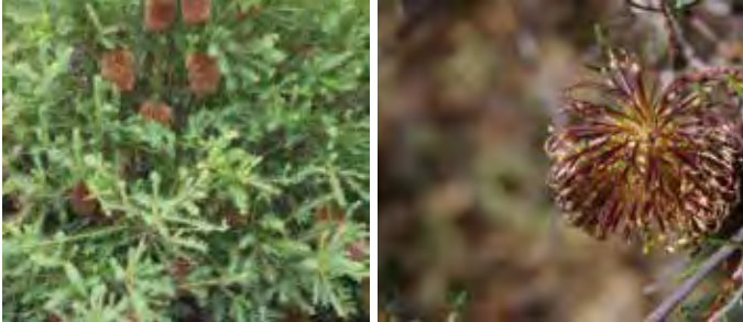
Top Calothamnus validus . Above Banksia nutans . Above right Banksia violacea .