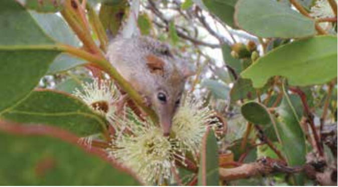
Top Honey possum. Above Barrens regelia ( Regelia velutina ).

Changing sea levels have left a wave cut platform at the seaward base of East Mount Barren, evidence that sea levels over 40 million years ago were more than 100m higher than today. The ancient mountain tops rising above the sea provided island refuges for primitive plants and animals when the peaks were surrounded by water.