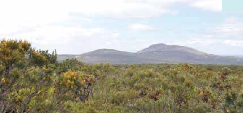
View from Sepulcralis Hill towards East Mount Barren.

plants. Many banksia species can also be seen along the track with descriptive names including creeping banksia ( B. repens ), nodding banksia ( B. nutans ), and violet banksia ( B. violacea ). The banksia genus was named after the naturalist Joseph Banks, who accompanied Captain Cook on his voyage of discovery in 1770.