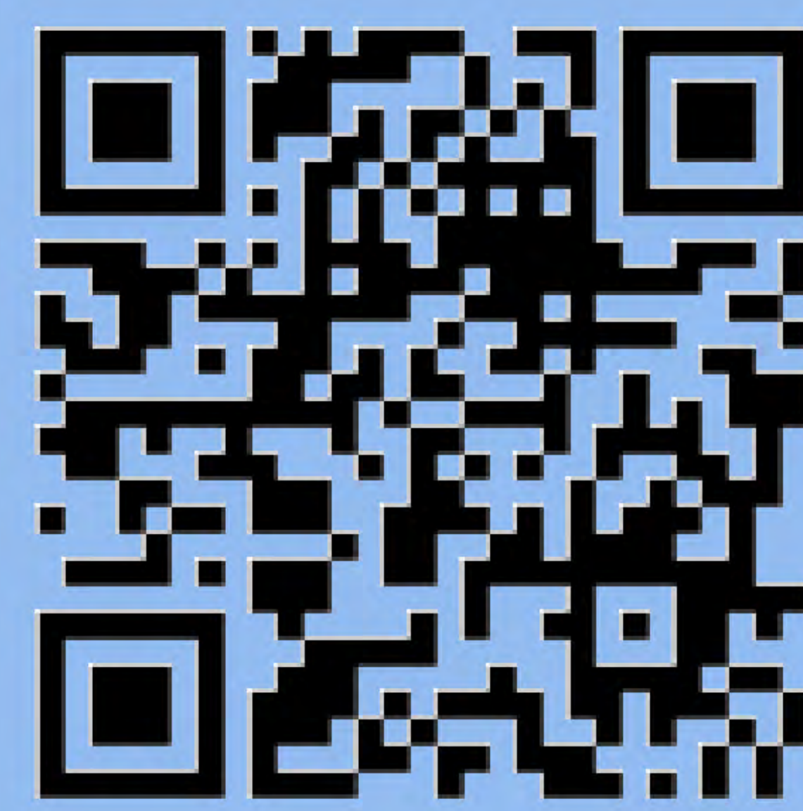
Scan the QR code to go to the online map

Although the Fitzgerald River National Park (FRNP) is 2% of Western Australia (330,000 hectares), it holds over 20% of WA wildflowers, many of which grow nowhere else in the world. FRNP is considered the Jewel in the Crown of the world renowned UNESCO recognised Fitzgerald Biosphere which is 1.5 million hectares. Hopetoun is the Eastern access to the Park and is two wheel drive accessible to Hamersley Inlet. FRNP is a pristine paradise with unique geology holding over 1880 plant species, 209 bird species and spectacular coast line.